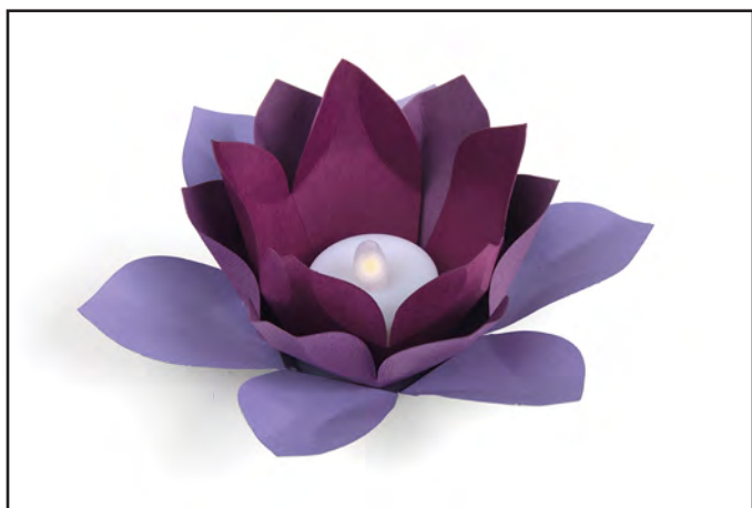
5. Use an electric tea light only. Do not use an open flame.