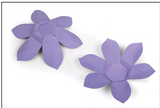
3. Adhere the petals to the hexagonal bases.