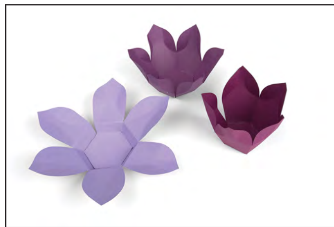
4. Arrange the petals as desired.