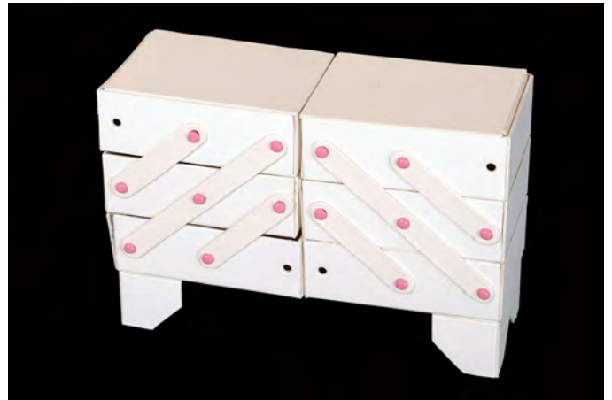
8. Fill and embellish as desired.