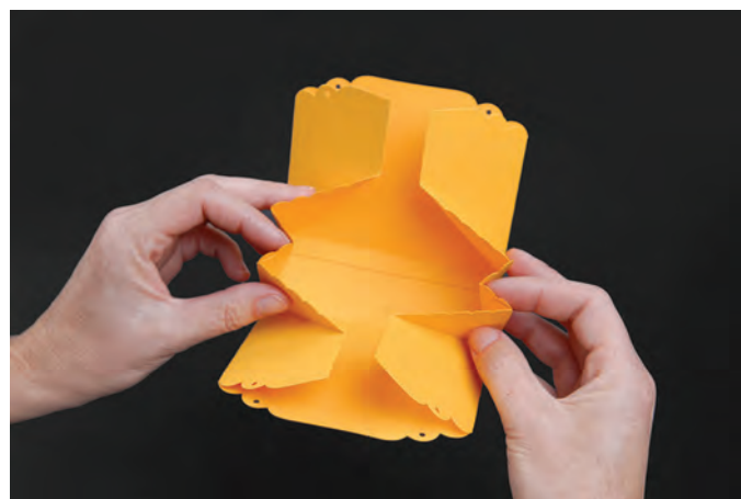
5. Accordion fold as shown.