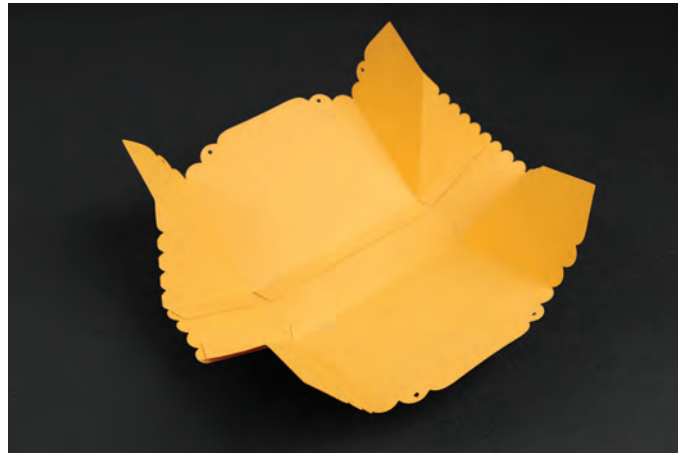
4. Attach the adhesive-covered tabs on the front and back pieces to the side flaps as shown.