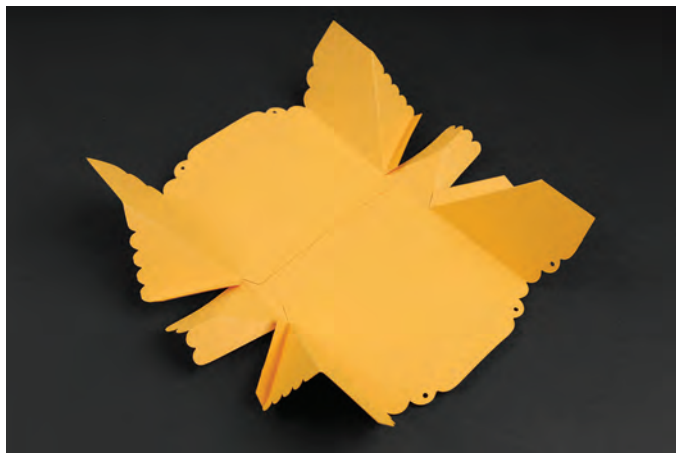
3. Adhere the Bag front and back to the bottom/side piece.