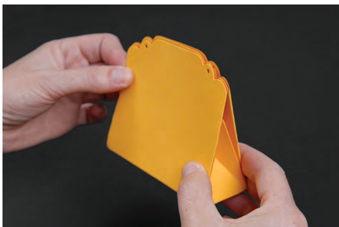
5. Align holes and use string to hold bag closed. Embellish as desired.