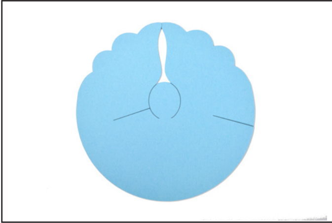
1. Die-cut the Angel out of desired material.