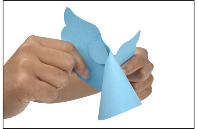
2. Curl the body into a cone shape.