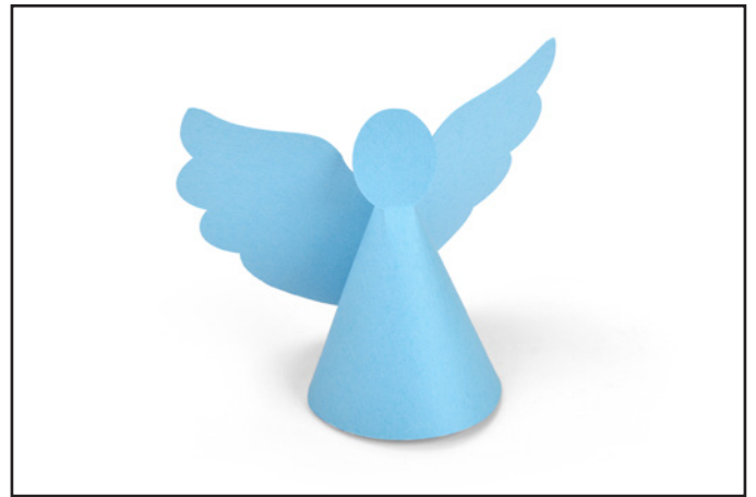
4. Use a piece of tape to hold the inside of the cone in position, and embellish as desired.