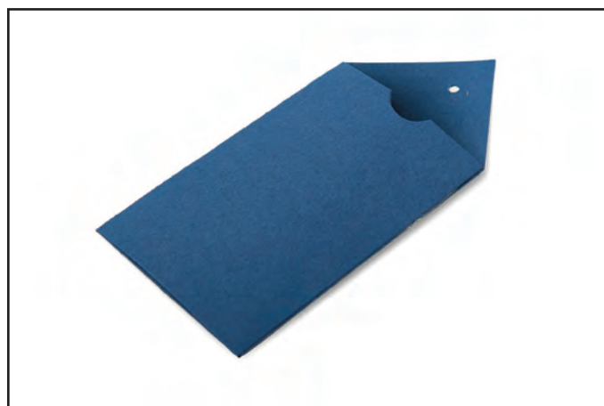
3. Adhere the front of the Card Holder to the tabs.