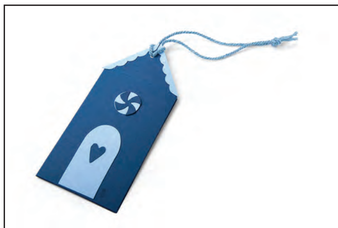
4. Embellish as desired.