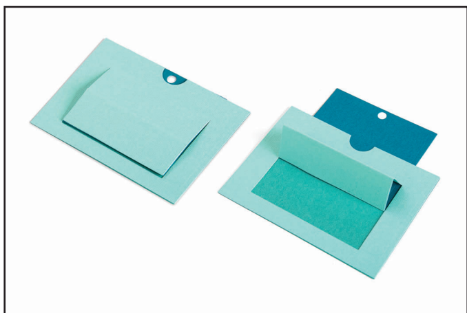
5. Pulling on the slider will cause the sliding window to open and reveal two areas that may be used for sentiments: the slider itself and the area behind the sliding door.