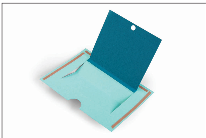
3. Attach the slider to the bottom edge of the sliding window on the card front. Apply adhesive to the bottom and side edges of the card front.