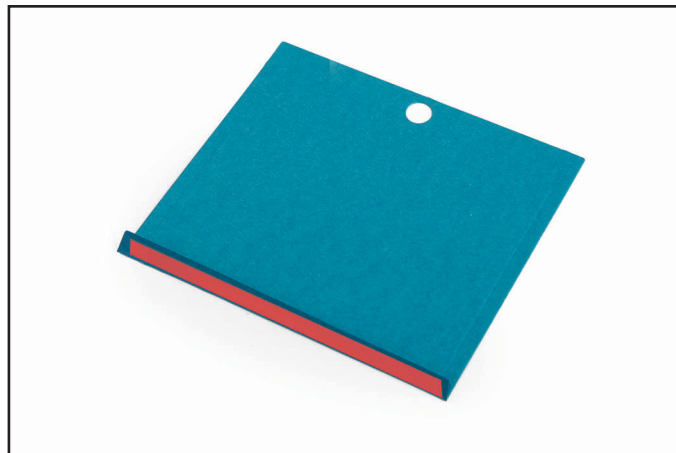
2. Fold the tab of the slider toward the front.